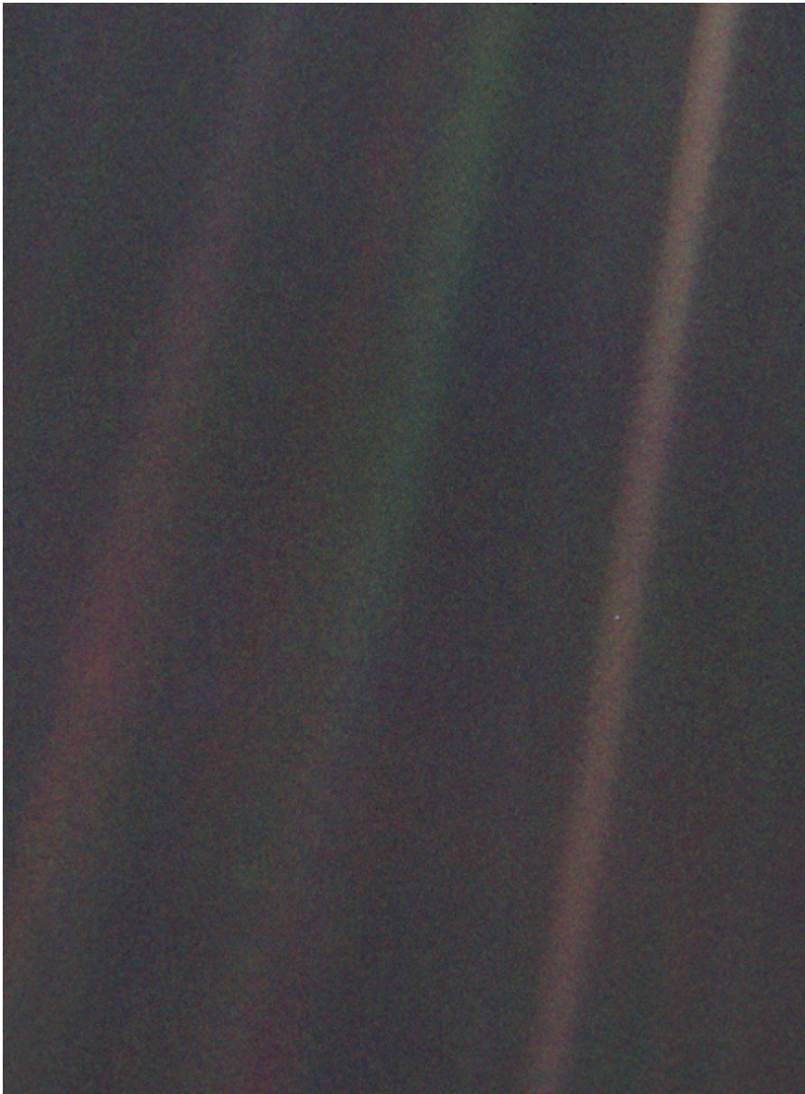
Foto der Erde, das von der Raumsonde Voyager 1 aus ca. 6,4 Milliarden Kilometern Entfernung aufgenommen wurde. Die Erde ist der winzige helle Punkt in der Mitte der orangenen Linie rechts. Sie nimmt auf dem Bild ca. 0,12 % eines Bildpunkts (Pixel) ein. Die Linien sind Reflexionen von Sonnenlicht auf der Optik der Kamera.